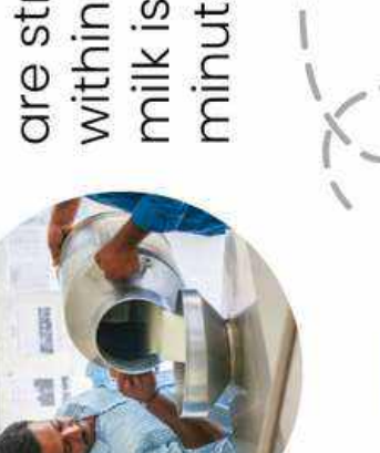
High-Quality Supply consistently delivers antibiotic-safe milk aflatoxin and