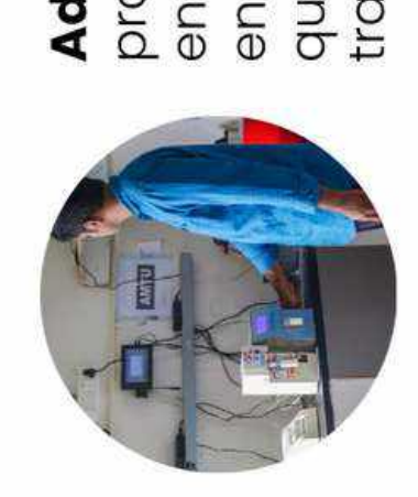
ensuring comprehensive Advanced Technology quality assurance and enabled value chain, provides a digitally traceability